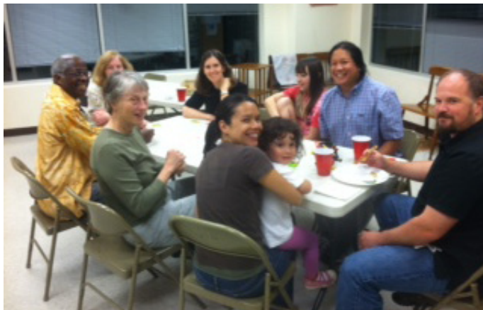
Friends gather on Family Game Night

We were challenged to keep track of our actions for three days, writing down as much of how we spent our time as possible, paying special attention to what upset us. Drivers around us, long lines, people with poor manners... At the end of the experiment, we discussed the possibility of more-joyful, less-stressed, and less-encumbered lives if we remained cognizant of the fact that most of us really don't know how long we have. Would we be happy with how we had spent our last days? From there we created a context to live by that was consistent with living with the end in mind.