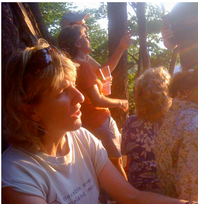
Sunset hike in the Blue Ridge Mountains

What do you or your family do to remember a pet or a relative who has died?