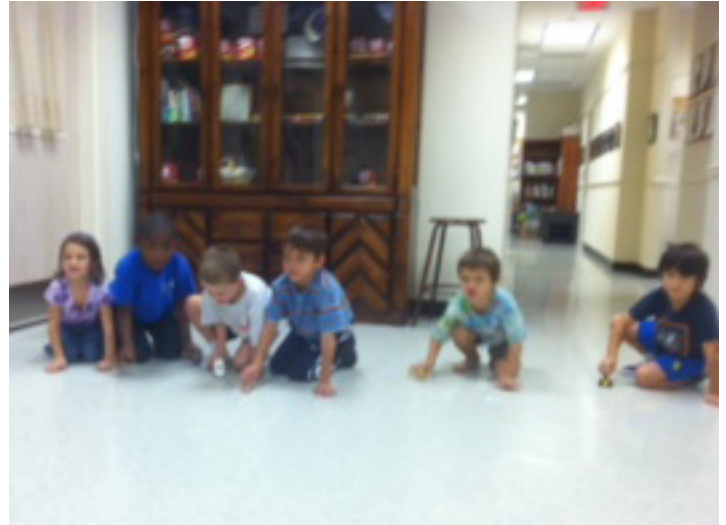
Family Game Night in full swing