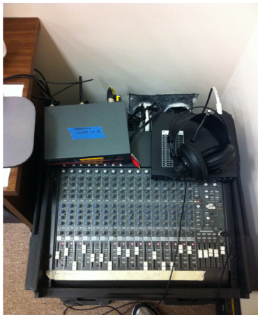
fig 3: sound board in sound alcove