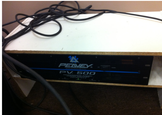
fig 2: amplifier - look for larges switch on front panel