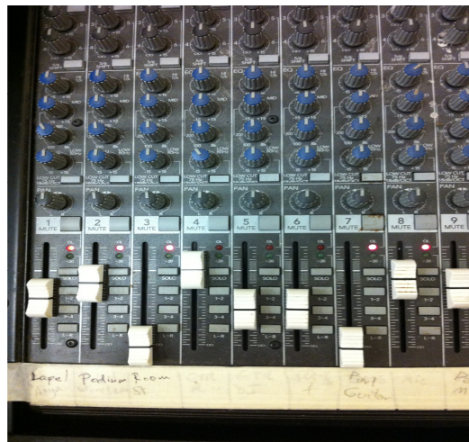
fig 8: sound board: please lower volume 5 & 6 before testing