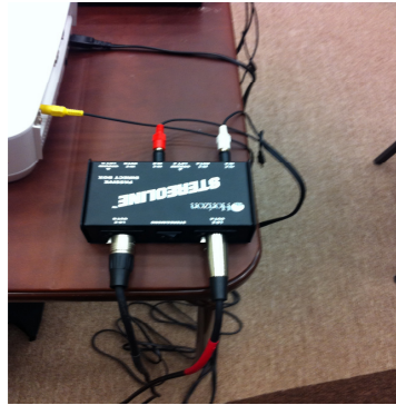
fig 3: passive box assembled with adapters