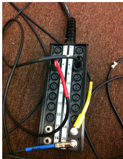
ig 4: sound system cabling to "snake" from adapter box