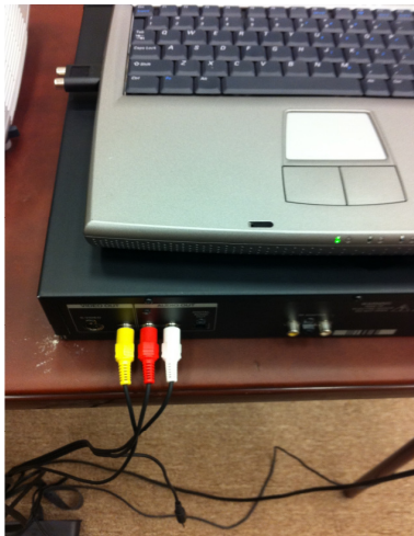
fig 1: video and sound from DVD player